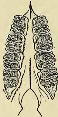
FIG. 4. PALATE OF DACTYLOMYS TYPUS [= D. DACTYLINUS], COPIED FROM REVUE ET MAG. DE ZOOL., 1852, NATURAL SIZE

middle dorsal area." The skull of boliviensis is smaller than that of d. canescens , Thomas's measurement of upper tooth-series being 21.5 mm. as against a length of 17.7 in boliviensis .